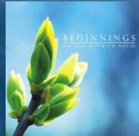
Beginnings , 2015 Calming Piano