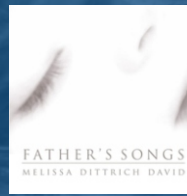
Father's Songs , 2002 Piano Lullabies